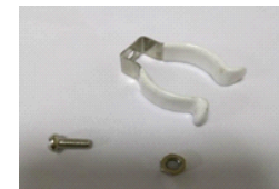
Accessory Clip Included for 8FT Lamps to prevent hanging